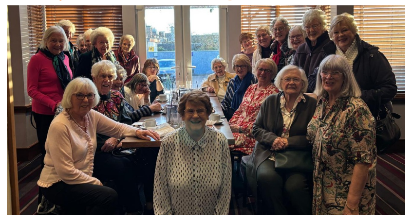
The Wednesday afternoon keep fit ladies enjoyed a Christmas lunch