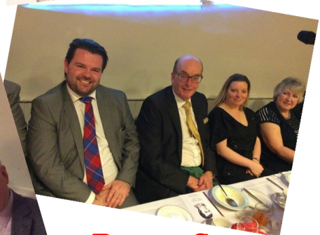
Burns Supper 2020