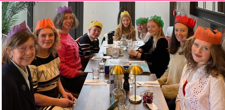
The Columba kids and leaders enjoyed a festive lunch at the Fox and Willow